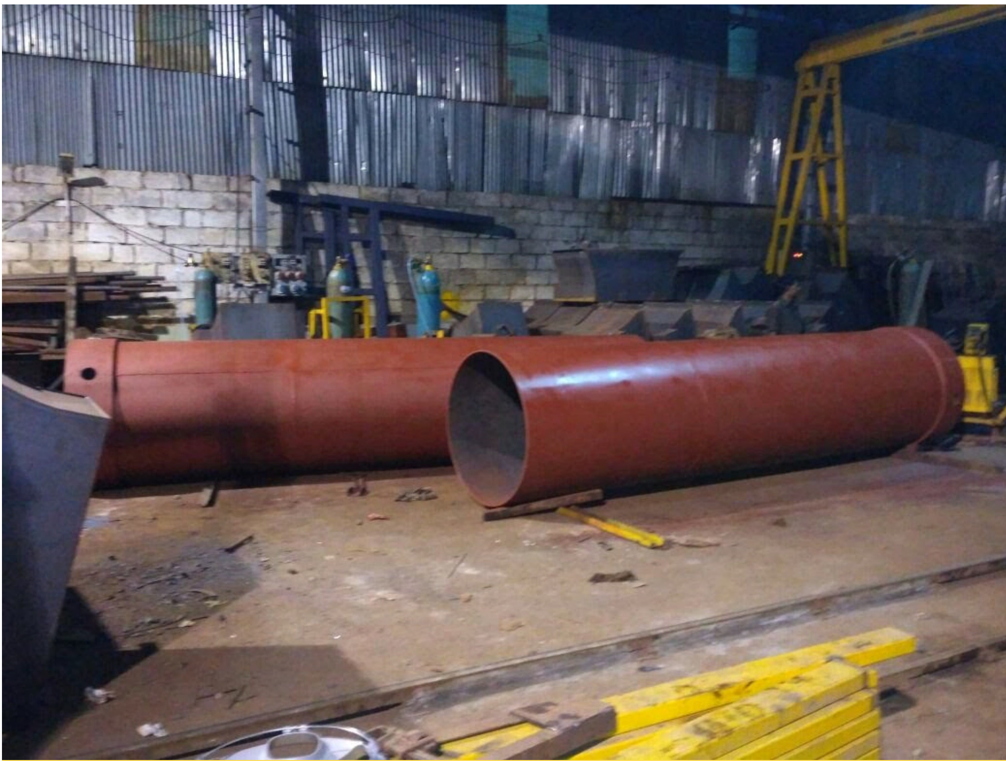
Construction Risk Management