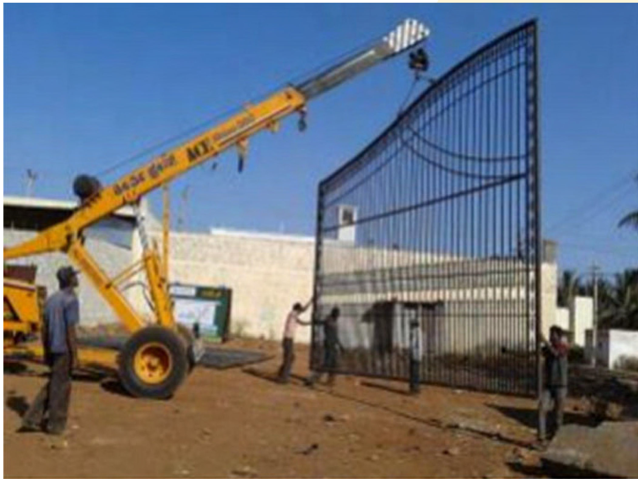
Restoration and Rehabilitation