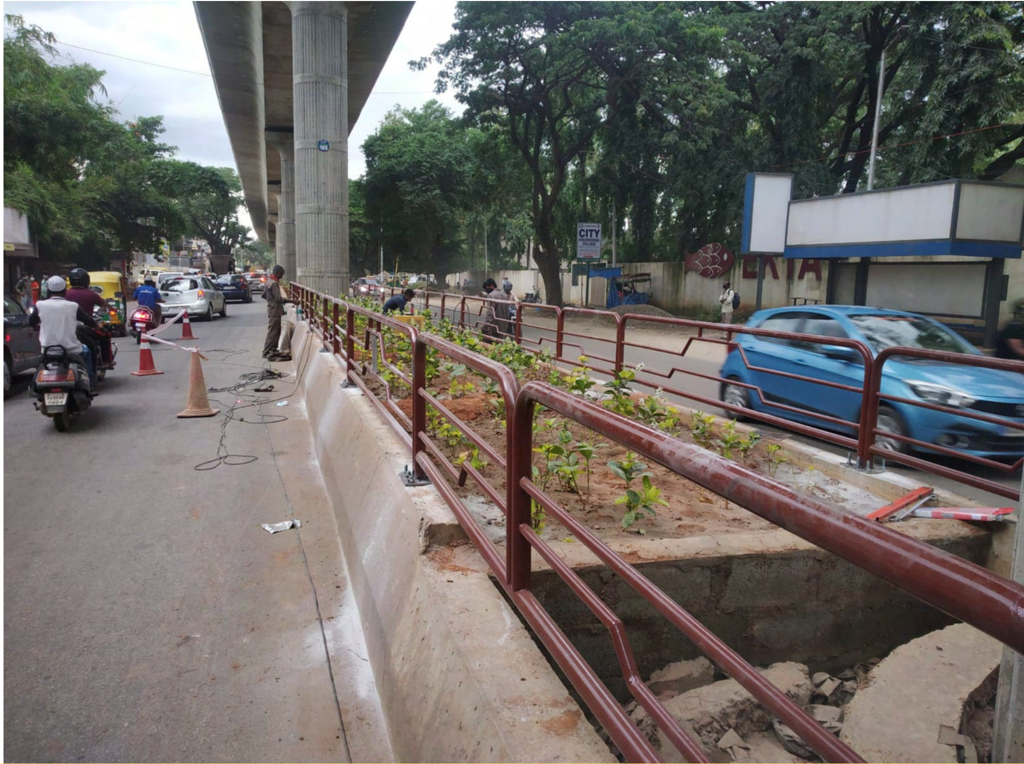
Construction Time Management