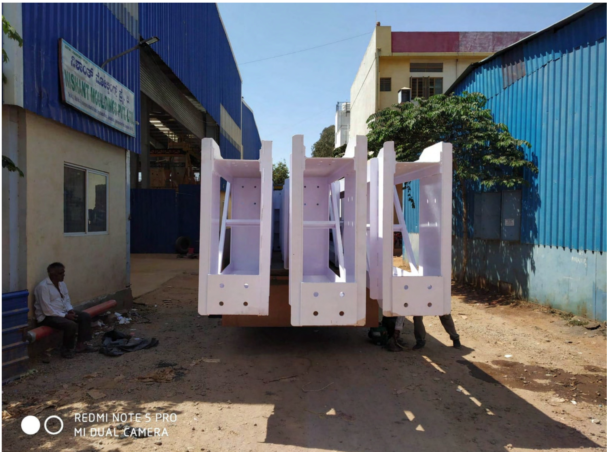
Project Planning and Scheduling