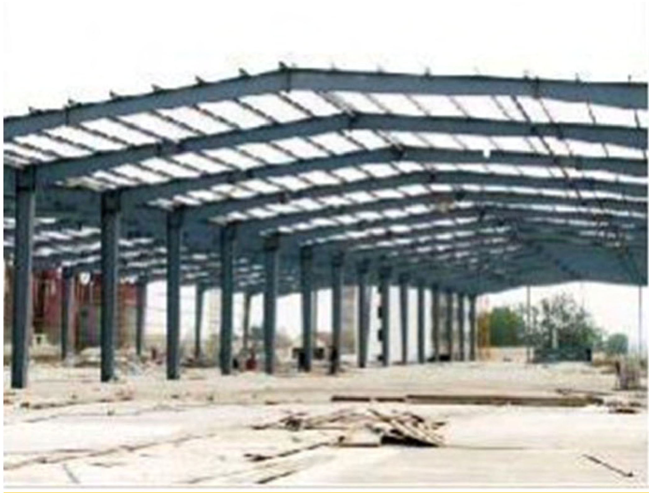
Fabrication and Erection