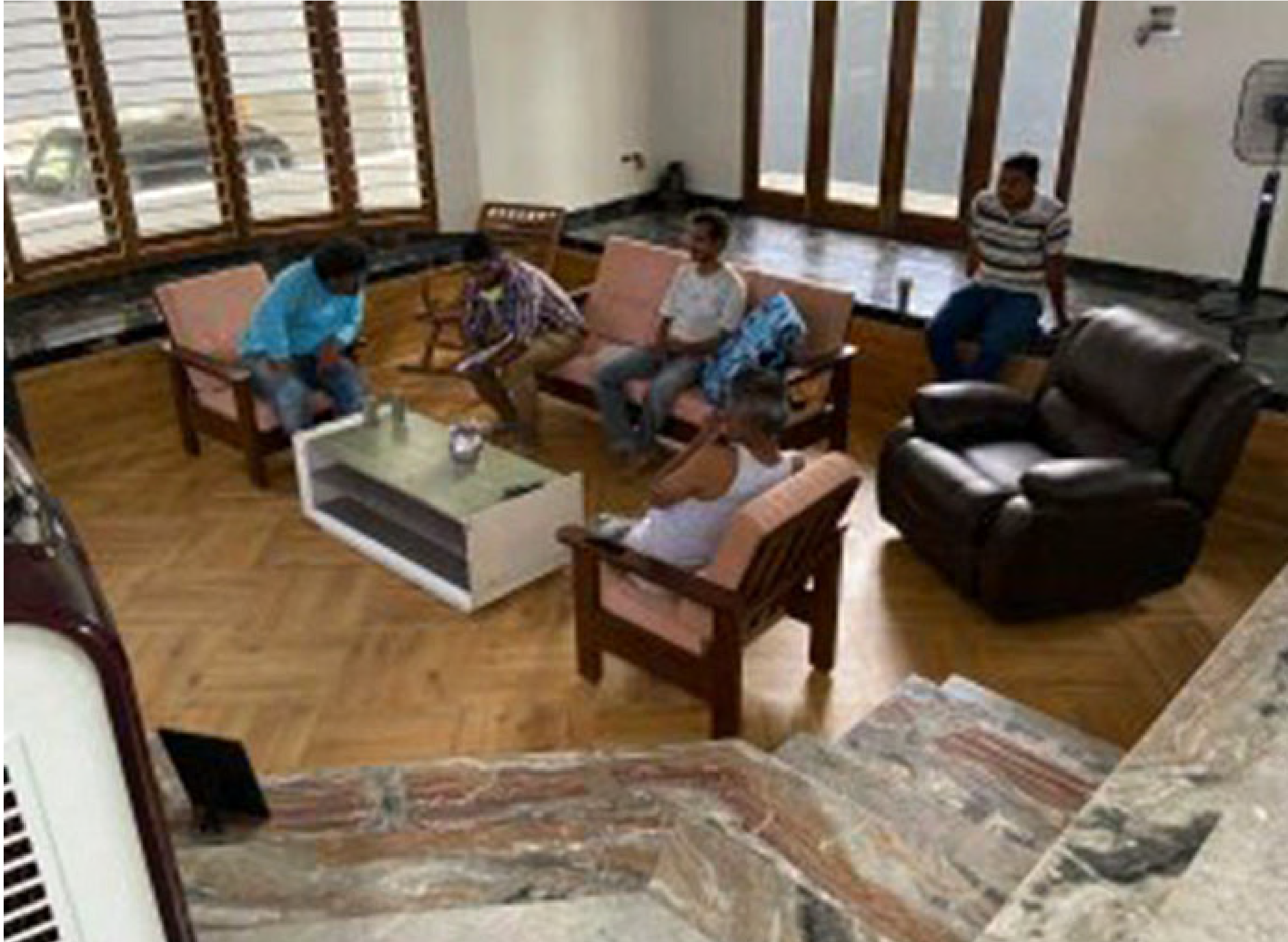
Financial Advice to Owner