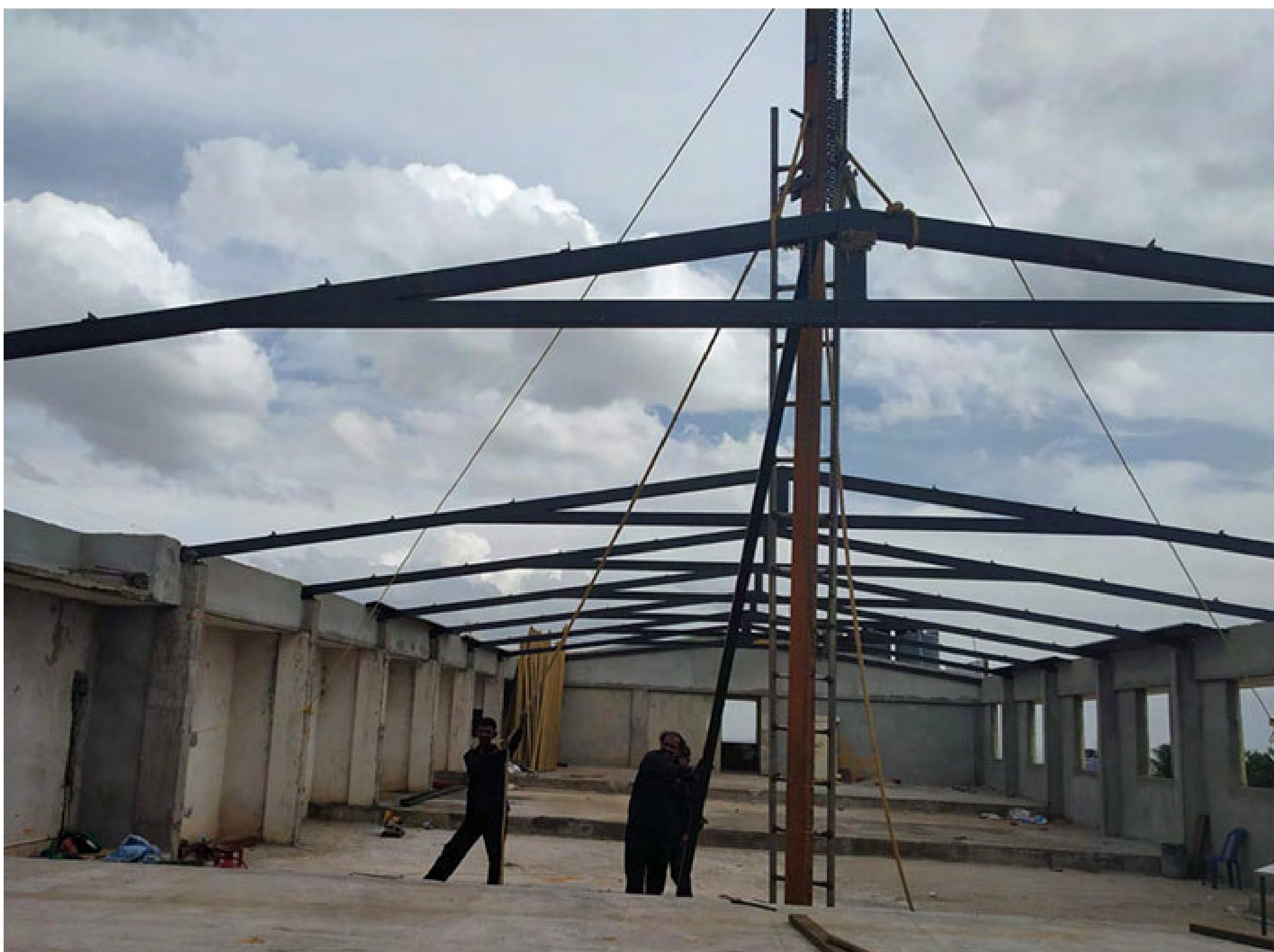
Supervisions and Monitoring